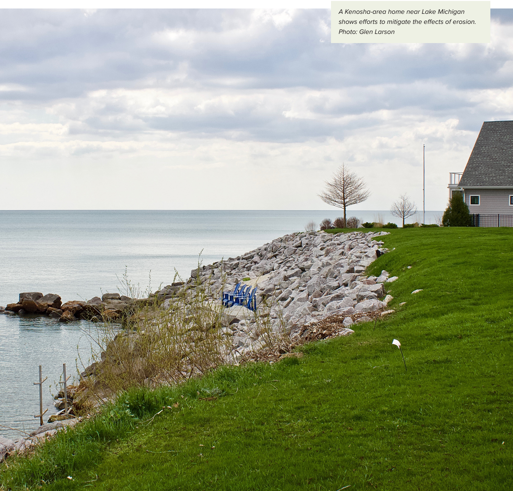
A Kenosha-area home near Lake Michigan shows efforts to mitigate the effects of erosion.

But the NOAA initiative gives communities reasons to hope that there are workable solutions for even the most seemingly intractable problems. Working together communities and government agency can find ways to adapt to our ever-changing environments.