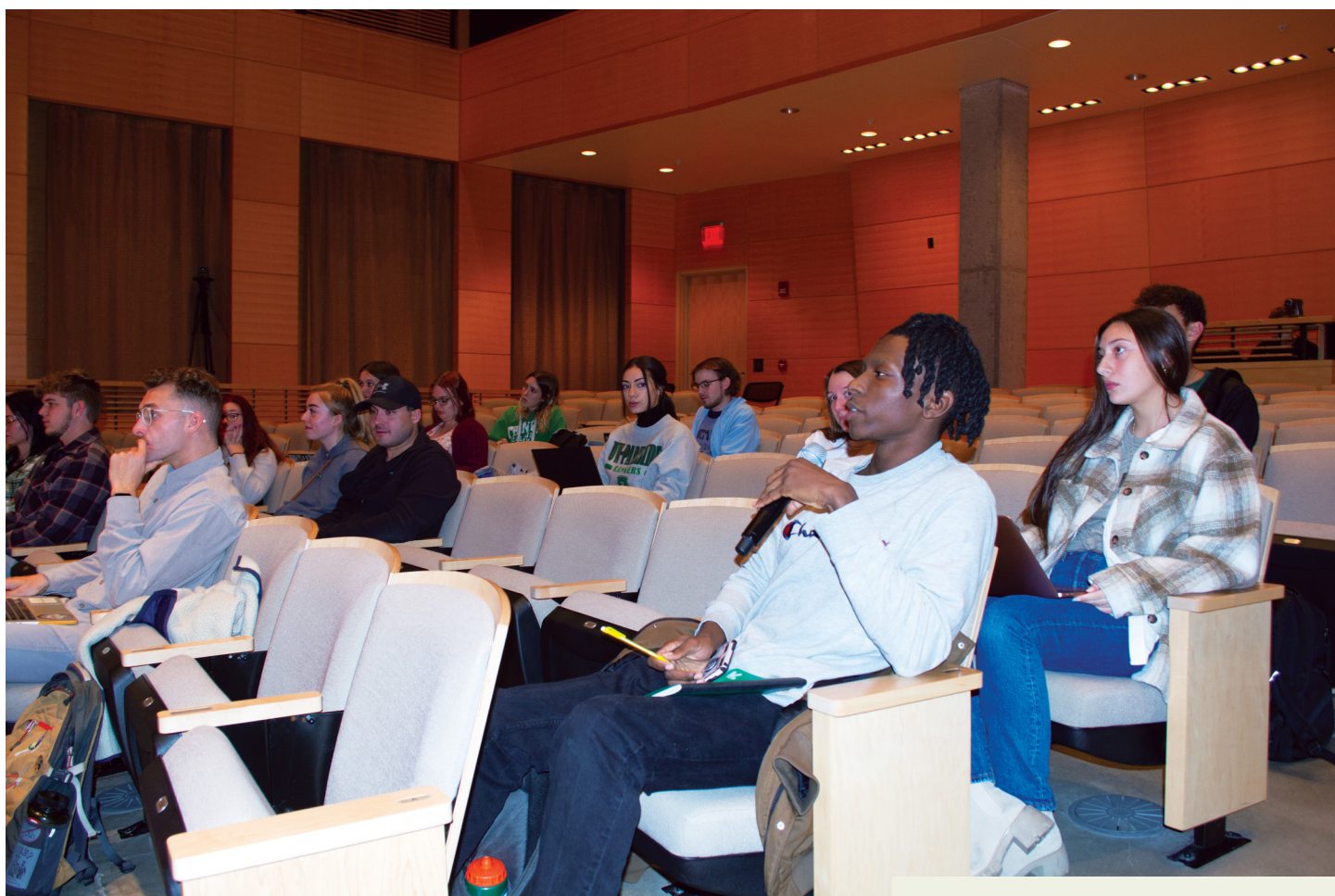
UW-Parkside COM 255 students discuss water science with a panel of experts in the Bedford Concert Hall.

These drawbacks unfortunately have led to many communities not switching to the better alternatives available now.